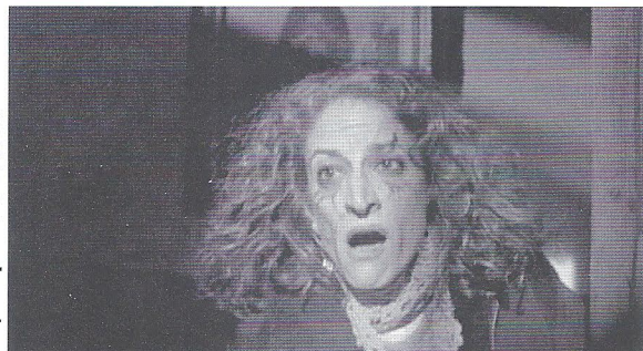
All illustrations this page: SATAN'S PLAYGROUND, except where indicated