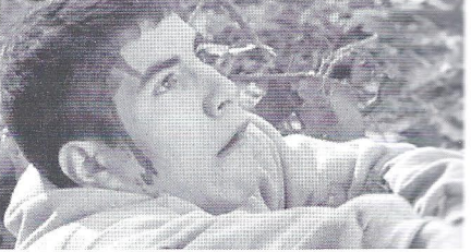
All illustrations this column: SATAN'S PLAYGROUND